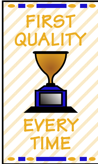
First Quality 3'X4' & 3'X5'