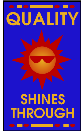
Quality Shines 3'X4' & 3'X5'

Our Digital Quality MessageMats™ are printed using the same state-of-the-art digital process as our ClassicImpressions™ Logo Mats. These colorful, attractive mats are made of soil grabbing, high twist Static Dissipative nylon yarn with a non-skid Nitrile rubber backing and are fully launderable. These mats remind employees of important quality issues and bring increased awareness that your business can strive for first quality every time. Digital Quality Mats are available in a variety of designs and colors. They reduce floor maintenance costs and help to raise quality standards.