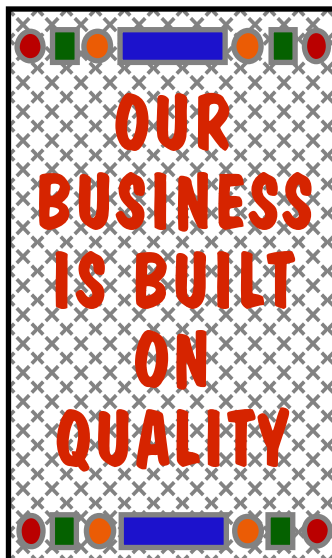
Quality/Business 3'X4' & 3'X5'