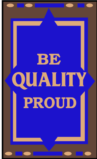
Quality Proud 3'X4' & 3'X5'