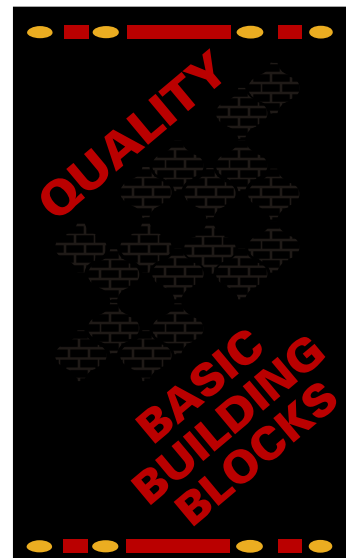
Quality/Blocks 3'X4' & 3'X5'